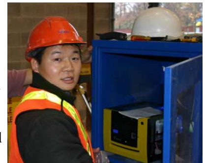
Data acquisition for Brentwood test

Work for Brentwood Industries in 2007 involved unique tests to establish the strength of a new polymer stormwater detention system. Buried in the large scale buried test facility at Queen's, a new reaction frame and servo-controlled test system demonstrated that this infrastructure could support a fully factored AASHTO-CHBDC truck. Jianfei used a novel approach to measure loads in the polymer structure and explain load sharing at working and ultimate loads.